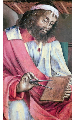
Euclid (~400 BC - ~300 BC)