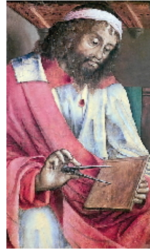
Euclid (~400 BC - ~300 BC)